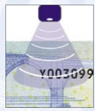
The sophisticated dual MG sensors detect the presence of magnetic ink, a common security feature among today's banknotes.

If, for example, you require a machine with ultraviolet, magnetic ink and infra red detection, you can select the SC 1500 UV/MG/IR model. The functions are easily selected by using dedicated keys on the front panel.